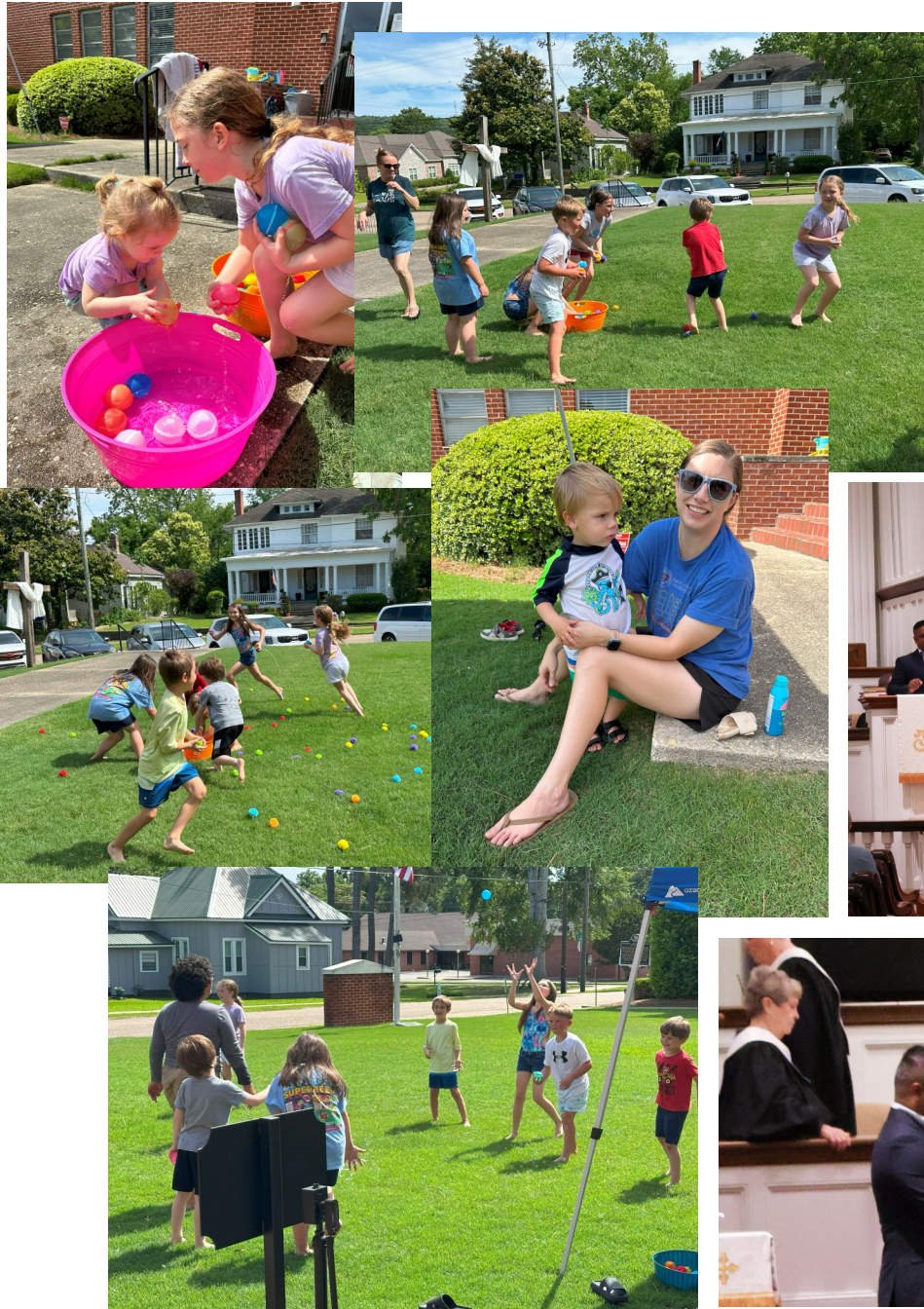
End of the year kid's splash party...